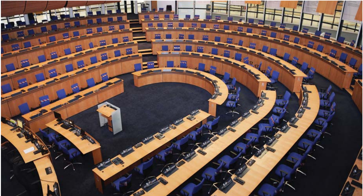
Online and on the ball: The City became the first metro in the country to pass its budget via an online platform.

The City's budget was revised to allocate R3,8 billion for Covid-19 aid. This extra expenditure is to ensure that the City can continue to deliver services and help boost the local economy.