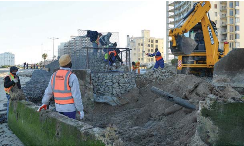
Sea through: The damaged section of Beach Road in Strand, where the City will start with emergency repair work recently.

Belhar Main Road upgrade In another major project, the extension of Belhar Main Road in Kuils River will reduce traffic congestion in Highbury and surrounding areas, and support future developments planned for this area. The new 1,45 km road will be a dual car-